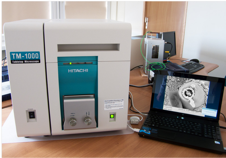
Documentation for TM-1000 benchtop electron microscope